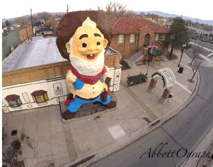
Last Chance Joe, 814 Victorian Ave., Sparks, NV